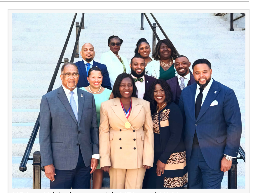
NBA at Whitehouse with NBL and NMA

WASHINGTON, DISTRICT OF COLUMBIA, USA, July 3, 2024 /EINPresswire.com/ -- Three of the United States' oldest and largest Black professional organizations, the National Bar Association (NBA), National Business League (NBL), and National Medical Association (NMA) are proud to announce a groundbreaking collaboration aimed at addressing critical issues impacting Black communities. This joint effort will focus