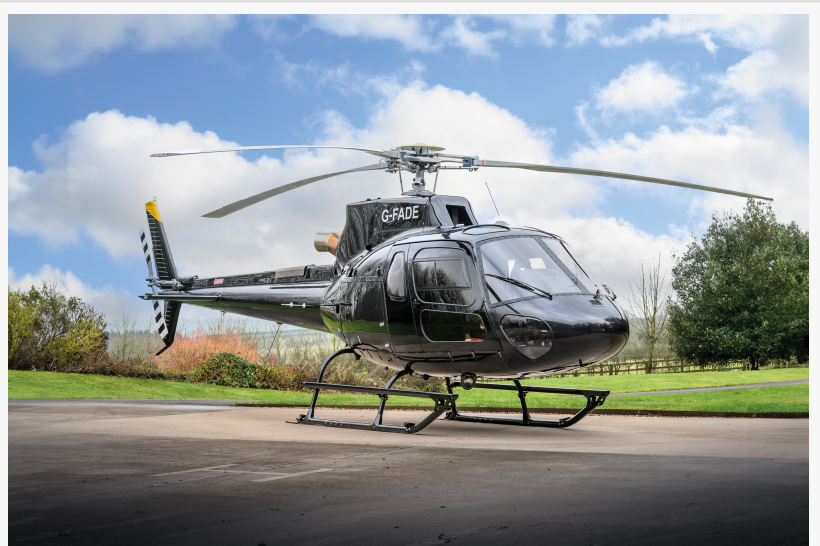
A 2023 Airbus Helicopters H125 in VIP configuration.

TORONTO, ONTARIO, CANADA, July 8, 2024 /EINPresswire.com/ -- Aero Asset, a leading global helicopter sales and market intelligence firm, has announced the release of its latest report, the 2024 Half Year Heli Market Trends Single-Engine edition. This report, backed by Aero Asset's expertise and proprietary market insight, offers a comprehensive analysis of the worldwide, preowned single-engine helicopter market in the first half or first semester of 2024. The data shows that global sales have stabilized on a positive trend for the first time in three semesters.