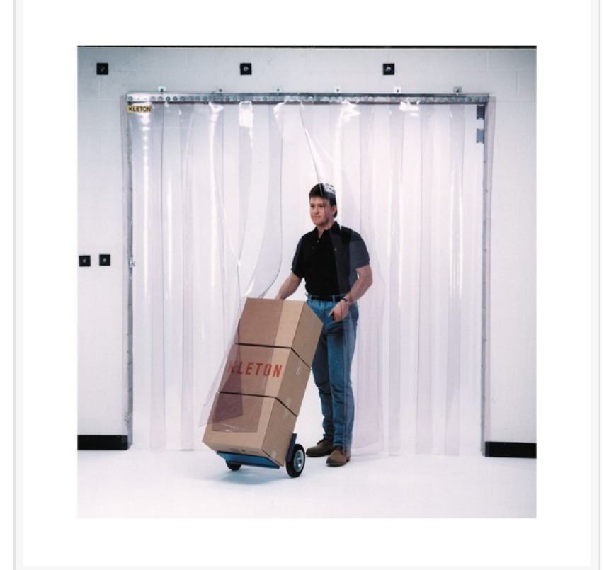
Champion Commercial Products

This press release can be viewed online at: https://www.einpresswire.com/article/724912773