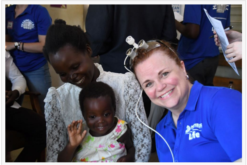
Malawi Hearing Aid Clinic Volunteer and Patients

For almost 10 years, HTC has been providing access to hearing healthcare in underserved communities and developing regions, bringing hope and healing people with hearing loss, both locally and globally.