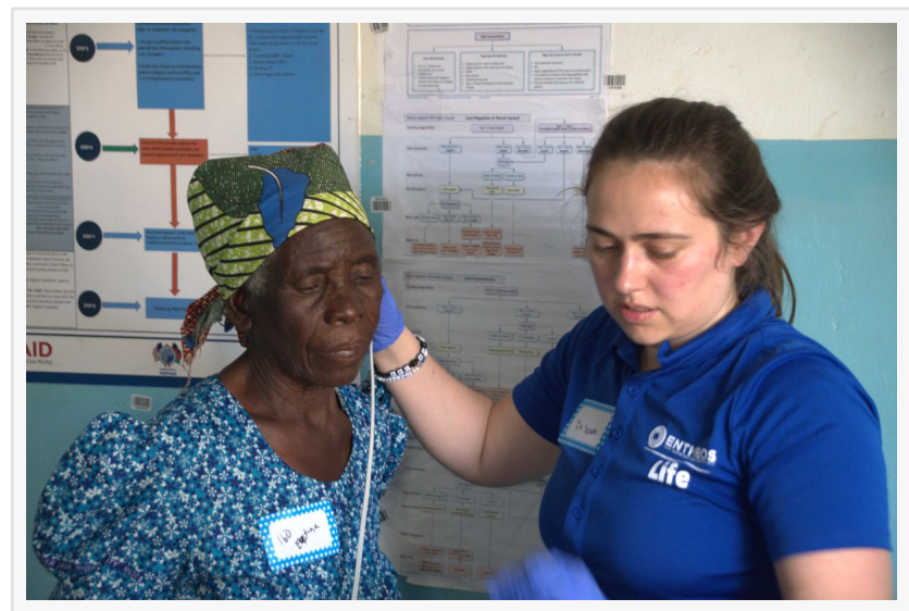
Volunteer Treating Patient in Hearing Aid Clinic

This press release can be viewed online at: https://www.einpresswire.com/article/724954806