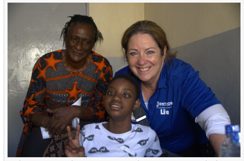
Volunteers and Patients in Malawi Hearing Aid Clinic

Based in Southfield, Michigan, Life for Relief and Development (LIFE) is a global humanitarian