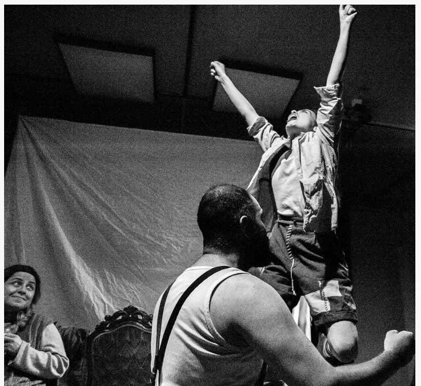
"My Heart's in the Highlands" performed by Hangardz

This press release can be viewed online at: https://www.einpresswire.com/article/725017246