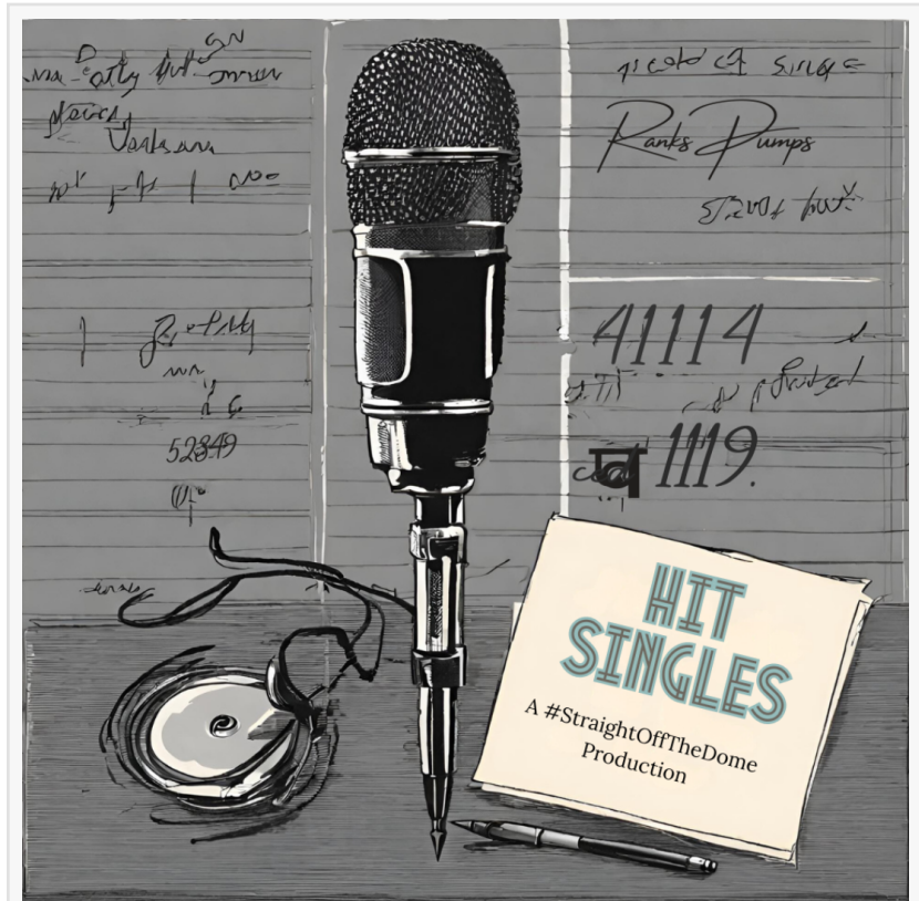
HIT SINGLES- A #STRAIGHTOFFTHEDOME PRODUCTION

The collaboration with Notably Written Publication ensured that the anthology received the professional touch it deserved, from editing and formatting to the final publication. This partnership underscores the