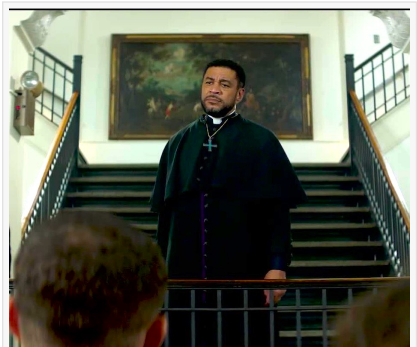
Harry Lennix in Godless