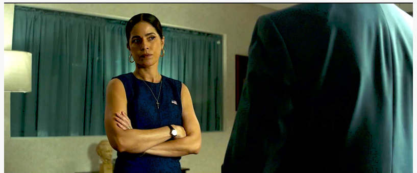
Ana Ortiz in Godless