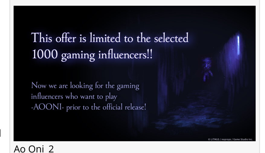
to 15x the game's normal speed. The dev team has ensured that both new players and those who've already cleared the game can enjoy this latest version. This game is also localized into ten languages, so not only fans in Japan, but fans all over the world can enjoy this release as well.

"Ao Oni" Trailer Video https://www.youtube.com/watch?v=4ghvokbjzBE