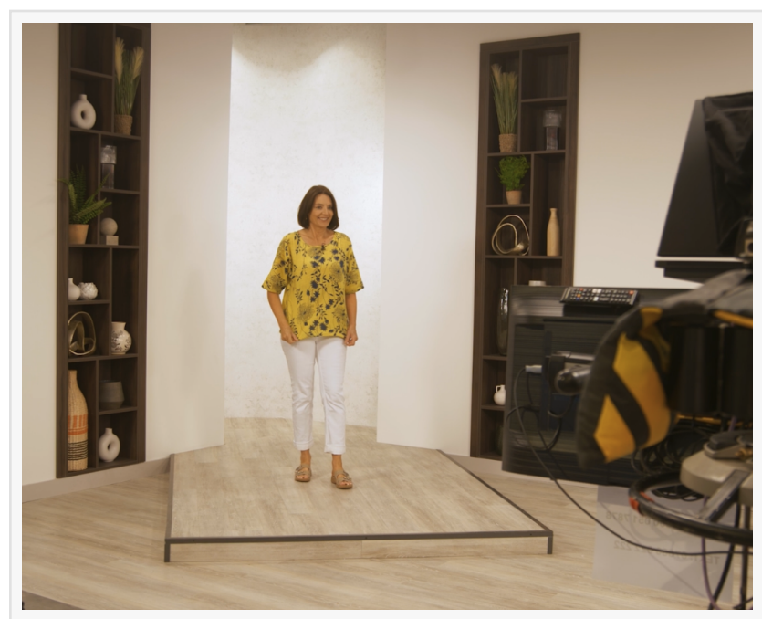
Catwalk in the new Ideal World studio