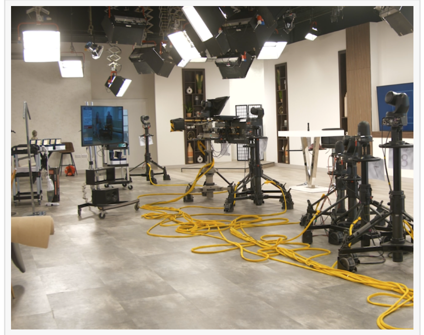
Behind the scenes in the new Ideal World studio

incorporated eco-friendly practices by reusing materials from old sets and giving them a fresh, new look. This initiative highlights the company's dedication to sustainability while maintaining