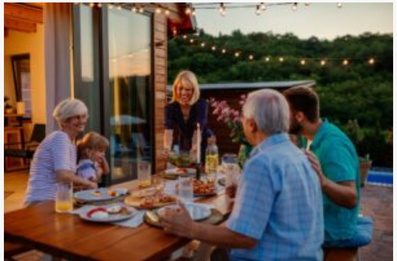
Enjoy Your Summer with Savings!