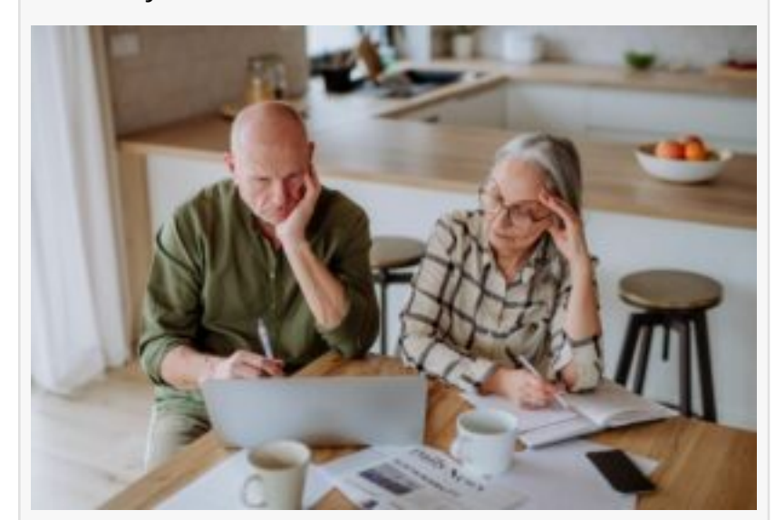
Electricity Deposit Waiver Program

secure electricity options without the burden of financial strain.