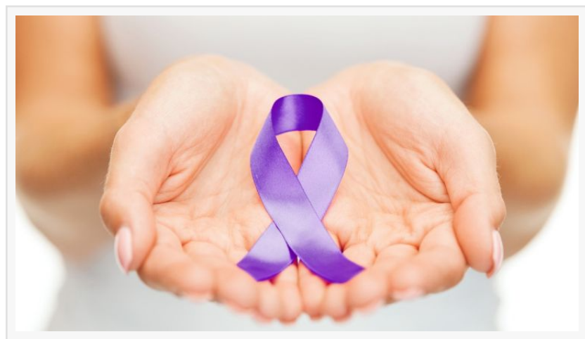
End Domestic Violence

2. Choose their preferred plan here and start the sign-up process on this platform. Electricity plans can exacerbate the challenges for individuals escaping hostile situations, often having left essential documents and belongings behind. By forgoing