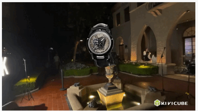
Immersive Watch Engagement

Kivicube's versatility extends to numerous sectors, including retail, e-commerce, art, tourism, gaming, healthcare, and education. This empowers businesses and creators to quickly and effortlessly integrate with Apple Vision Pro, unlocking the vast potential of the spatial computing market and attracting a new wave of users.