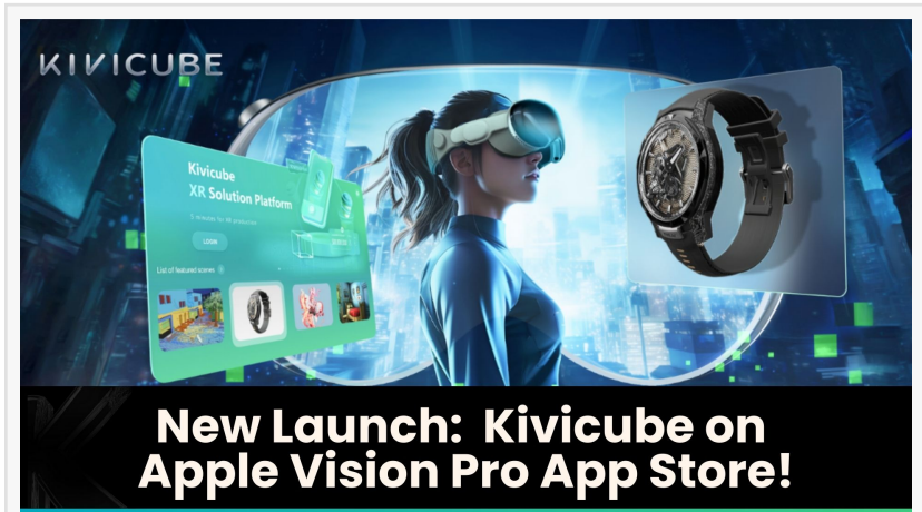
Kivicube on Apple Vision Pro

The Kivicube app on Apple Vision Pro features a user-friendly drag-and-drop interface, allowing users to seamlessly place 3D models within real-world environments, animations, and view