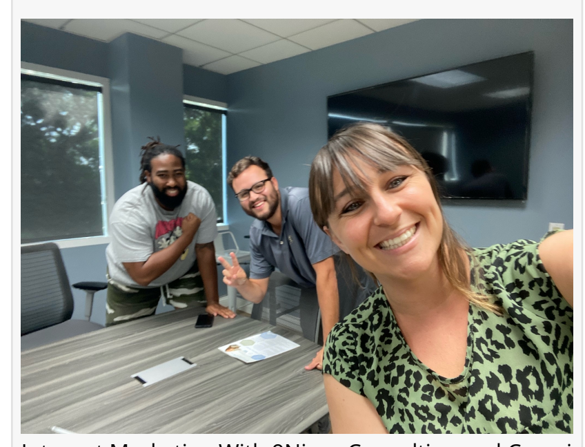
Internet Marketing With 9Niner Consulting and Ceemi Agency of Baltimore, MD and Ceemi Agency of Destin, FL

era of growth and influence. Our vision extends far beyond these regions as we aim to support businesses nationwide with the tools, strategies, and insights they need to reach unprecedented heights."