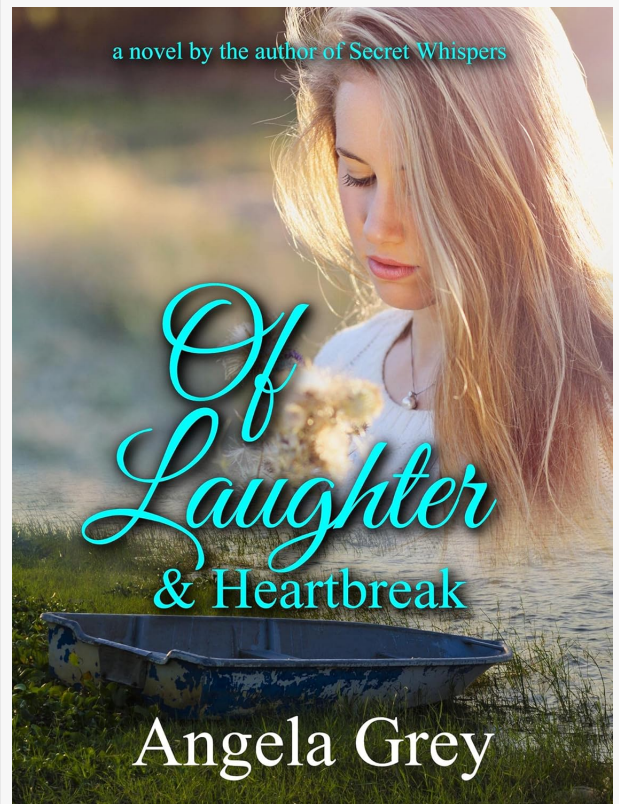
Of Laughter & Heartbreak mystery novel book cover