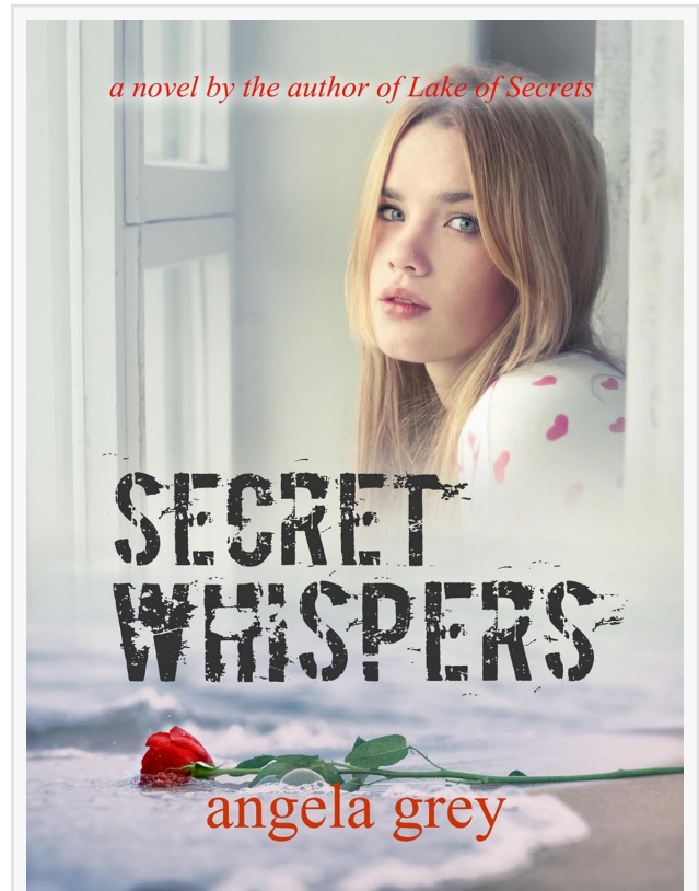
Secret Whispers mystery novel book cover