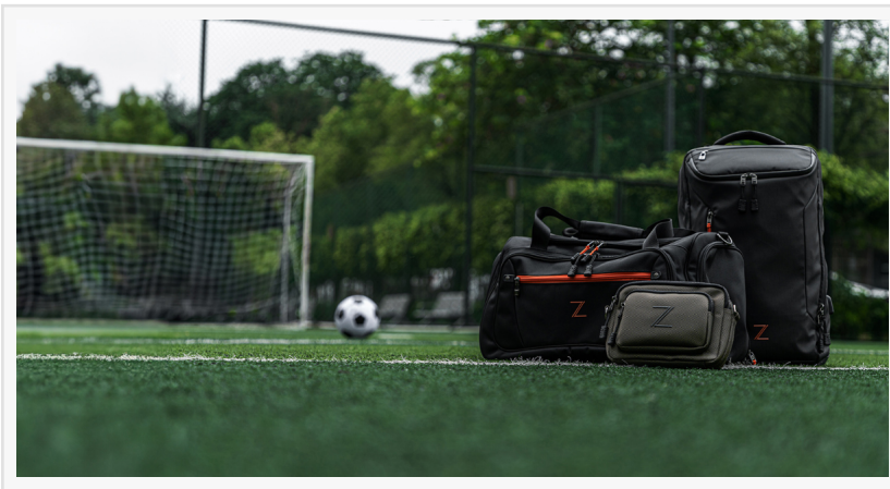
zitahli backpack and carry ons

Recent industry data highlights the growing prominence of the backpack market. According to a report by Grand View Research, the global backpack market is expected to reach $32.2 billion by 2025, growing at a CAGR of 6.2% from 2019 to 2025. This surge in demand is driven by the rising popularity of outdoor activities, the