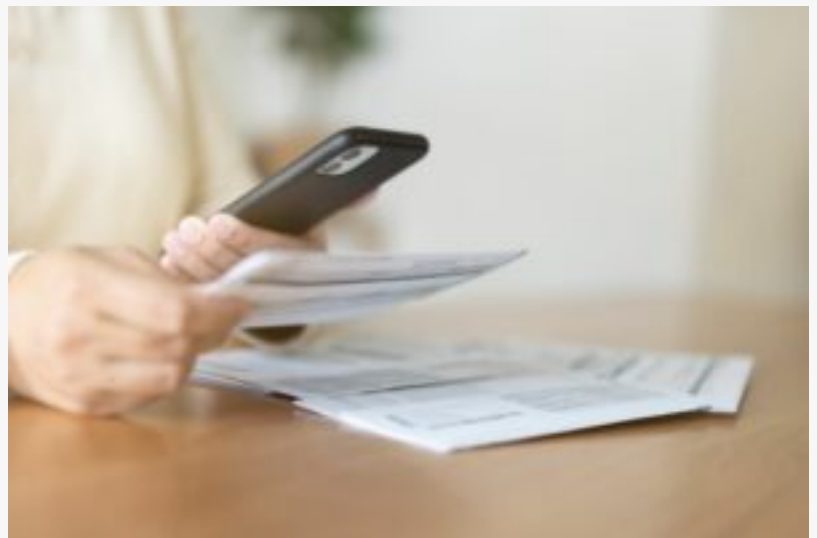
Shop and Compare Electric Plans