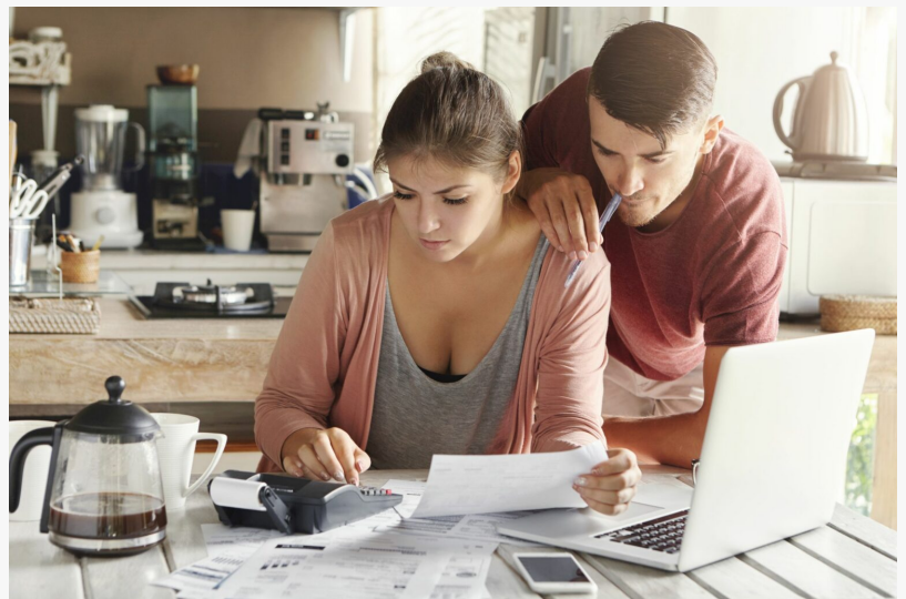
Exercise Your Power To Choose Your Electricity Plan