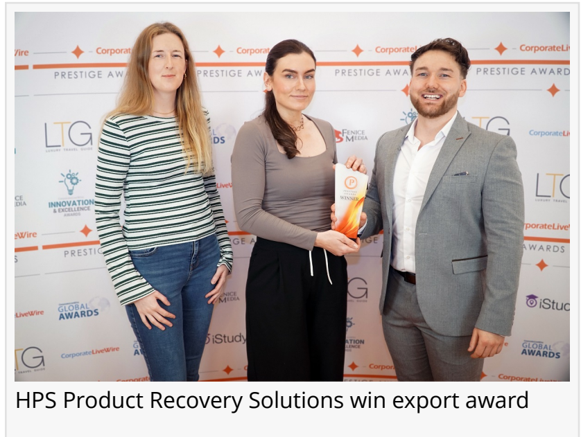
HPS Product Recovery Solutions win export award

NOTTINGHAM , NOTTINGHAMSHIRE, UNITED KINGDOM, July 9, 2024 /EINPresswire.com/ -- HPS Product Recovery Solutions, specialists in Advanced Liquid Product Recovery ( Pigging ) Technology, has been honoured with the Export Award at the Central England Prestige Awards. This accolade acknowledges HPS's exceptional performance and growth in international markets.