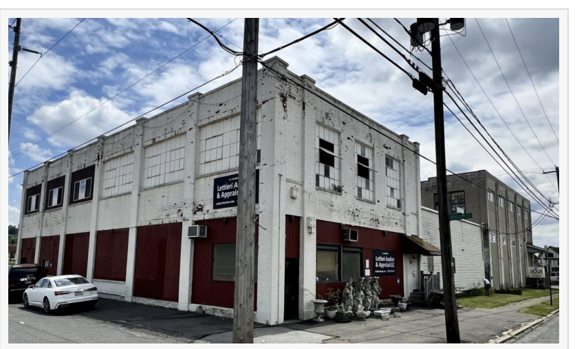
Auction House Auction - Complete Liquidation Retirement Sale Scranton, PA

This up-and-coming section has new shops, restaurants and apartments springing up all around. The auction, driven by the owner's decision to retire. The owner is selling the Real Estate, the final contents and liquidating the business. The contents sales are scheduled in July and listed on www.lettieriauction.com.