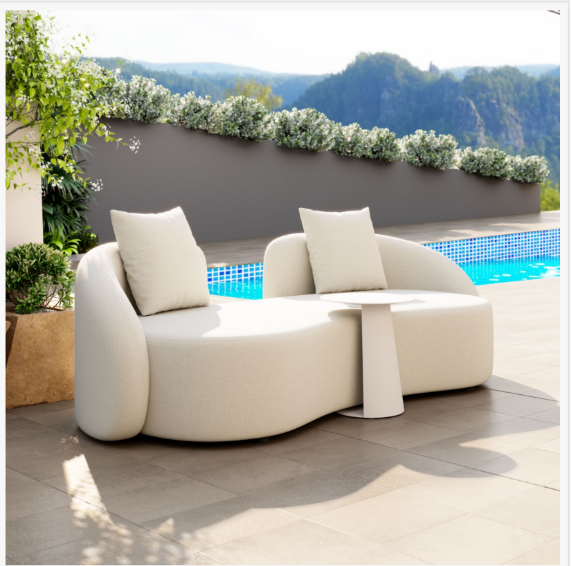
ZUO's Outdoor introductions in Atlanta will include the modern organic kidney shape Sunny Isles Loveseat for luxurious lounging outdoors.

"We love that our customers can't wait for our new collections to debut at each market," Luis Ruesga shared. "And that they love our fresh take on mid-century modern. With bold contemporary designs that freshen up any retail floor or design project. We are proud to continue our rich legacy by creating innovative and unique collections that add a touch of sophisticated glamour for any indoor or outdoor living space."