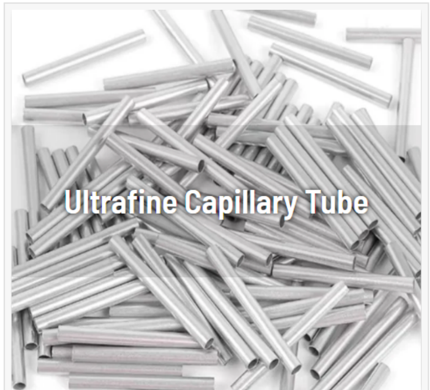
Ultrafine Capillary Tube