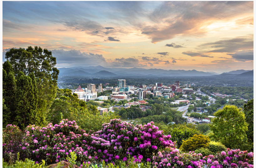
Asheville, NC