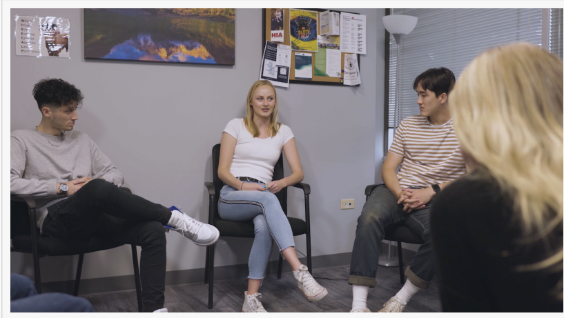
Group therapy session at Sandstone Care Denver, Colorado.

Conveniently located directly off I-25 and Hampden Avenue, the Denver Outpatient Center is easily accessible from surrounding cities such as Aurora, Littleton, Englewood, Centennial, and