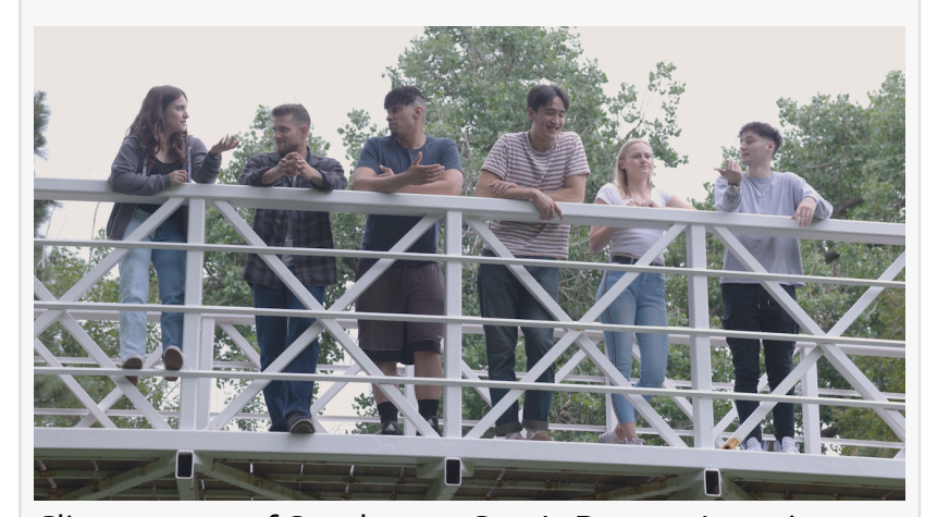
Clients at on of Sandstone Care's Denver Location

Lakewood. The facility features ample natural light, comfortable community and treatment areas, and modern amenities designed to support recovery.