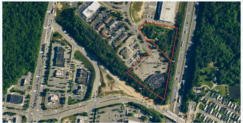
5800 Southpoint Centre Blvd., Fredericksburg, VA 22407