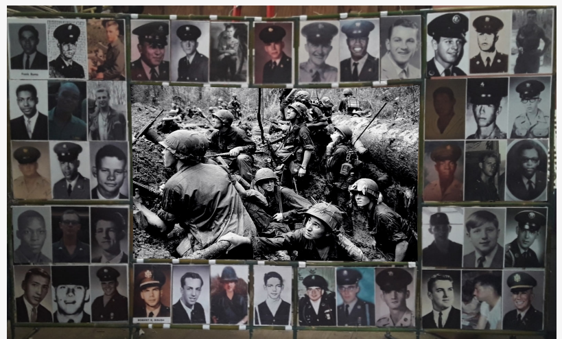
Picture of the Dead in the Play of Summer of Love and War about the battle of Xom Bo II