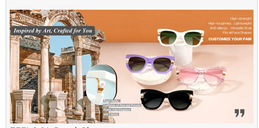
ZEELOOL Pearl Glasses