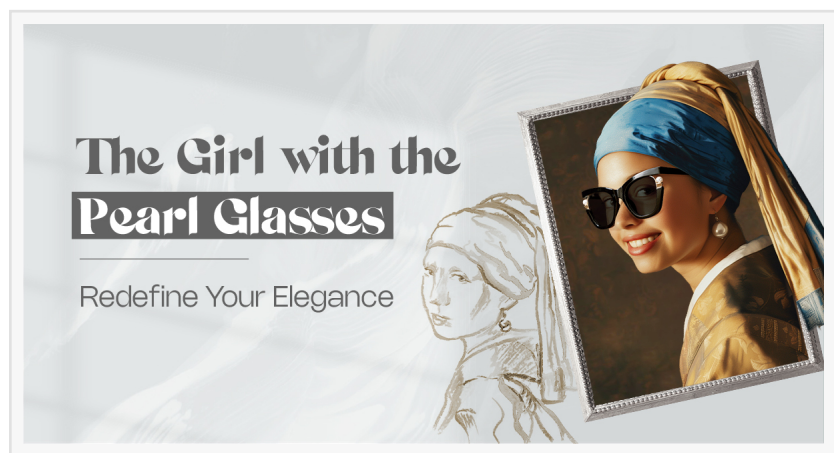
The Girl with the Pearl Glasses

Unlock Feminine Charm with Pearl Glasses