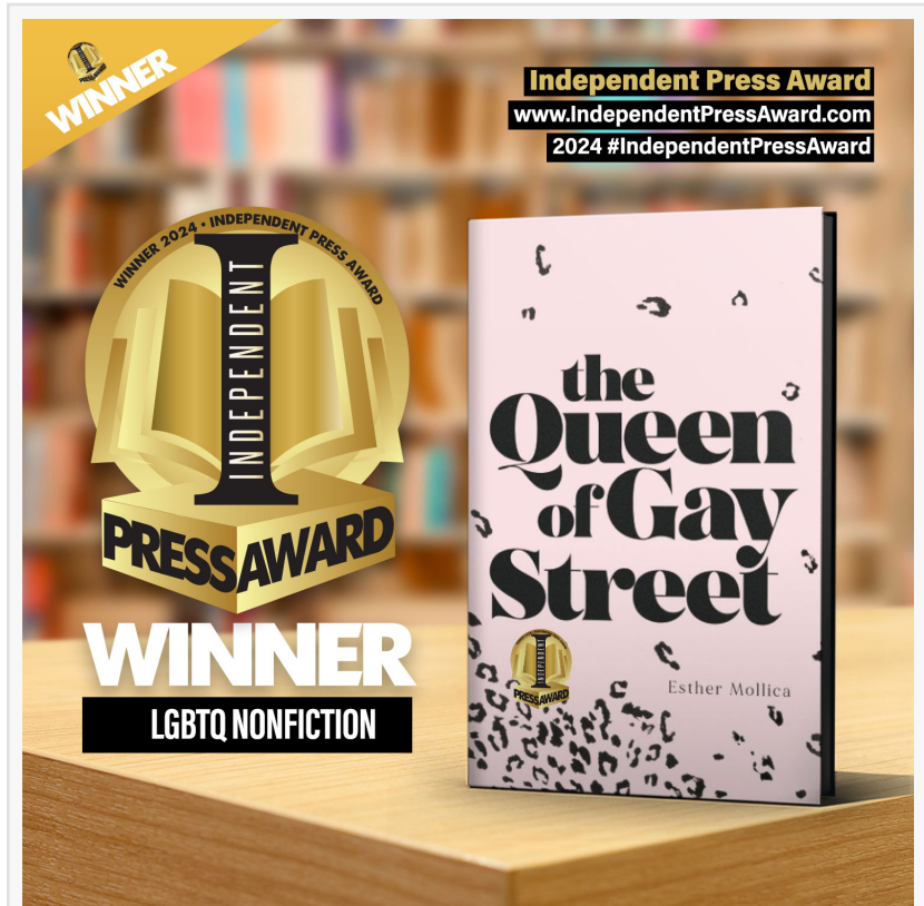
2024 Independent Press Award Winner

Gritty, dazzling, heartfelt, and hilarious, The Queen of Gay Street is a personal window into the queer dating scene and a promise that those in search of true love will find their own happily ever after.