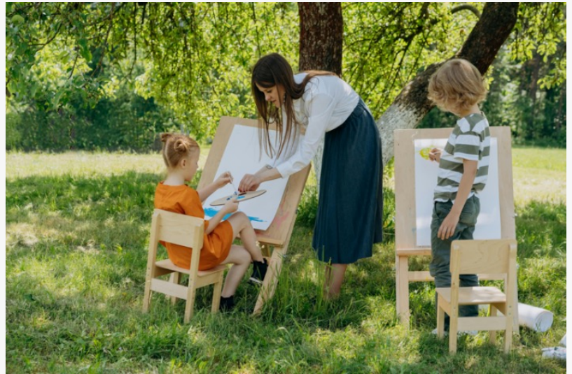
99active kids painting class offered by a local

99active closes this gap by connecting skilled activity providers with the local community to offer experiences that return to simplicity, tapping into the essence of 'now'—free from unnecessary complexities.