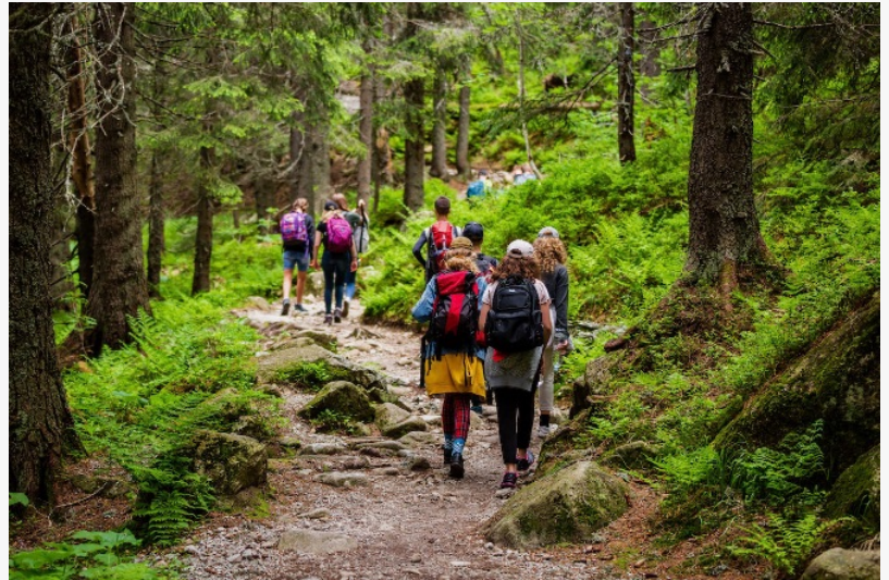
Sunday hiking tour offered by a local