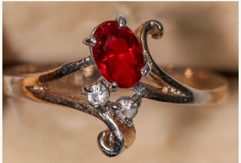
Gorgeous petite gold ruby ring testing 14 carat gold and featuring an oval ruby and two small white stones, weighing 2.3 grams (est. $300-$500).