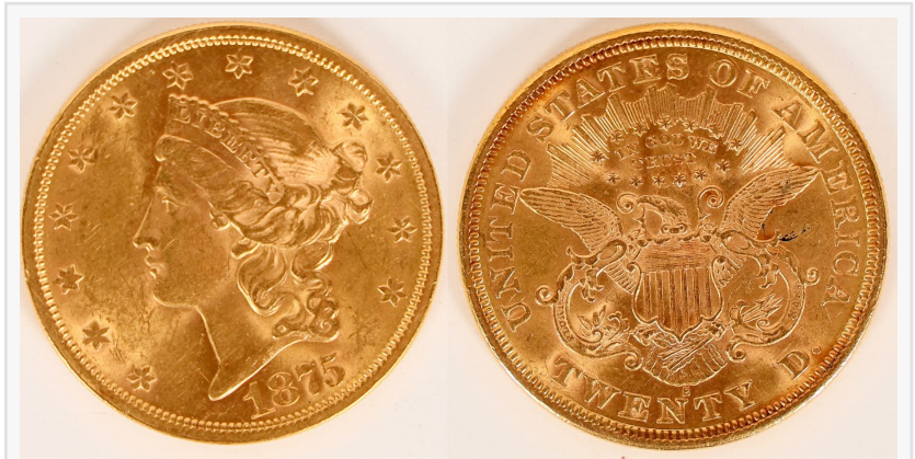
1875-S U.S. $20 Liberty Head gold coin, in Almost Uncirculated condition, from a total mintage of 1,230,000 coins (est. $2,500-$3,500).

RENO, NV, UNITED STATES, July 9, 2024 /EINPresswire.com/ -- Holabird Western Americana Collections, LLC will look to take some of the edge off of summer's sweltering heat with a cool, two-day Timeless Treasures Auction on Saturday and Sunday, July 13th and 14th. The online-only event is loaded with 1,584 lots of numismatics , Western Americana, postal history and more. Online bidding will be provided by iCollector.com .