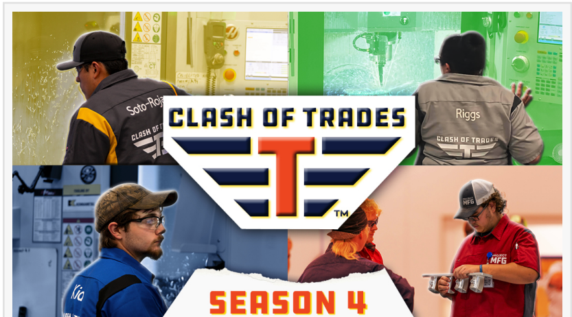
Season 4 of Clash of Trades comes out July 12th!

Episode 1 releases July 12th at 7pm CST, will highlight the first regional competition that was held at Texas A&M TEE's facility in College Station, Texas. It featured six competing teams: Vincennes University, Autry Technology Center, Pickens Technical College, South Adams High School, Lowell High