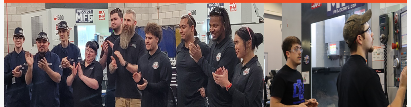
Who are you cheering for in Project MFG's Clash of Trades?