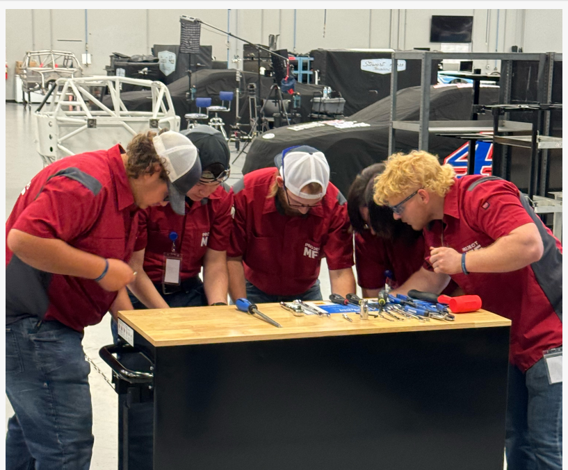
Autry Tech takes on the tool box challenge

Episode 4, releases August 2nd at 7pm CST, is the National Championship that was held at the Stewart-Haas Racing Facility. Stewart-Haas drivers Cole Custer & Ryan Preece made a special appearance to cheer the Advanced Manufacturing teams on and talk about how important