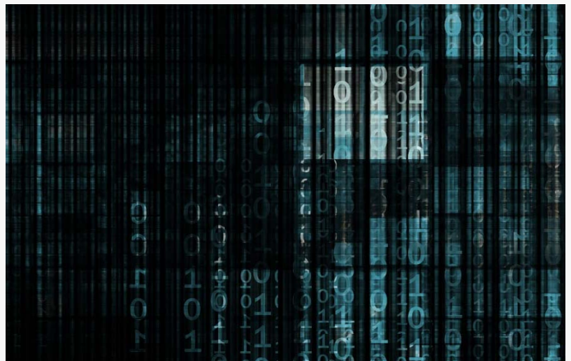
Houston Managed service provider