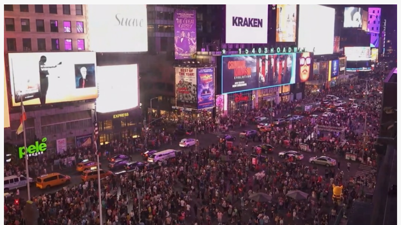
In Search of Texas Justice Widow's Nightmare on Times Square, New York

From the first page to the last, readers are taken on an intense journey of legal twists and endless trials that tested human resilience to its limits.