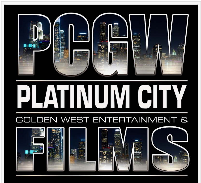
Platinum City Golden West Entertainment & Films