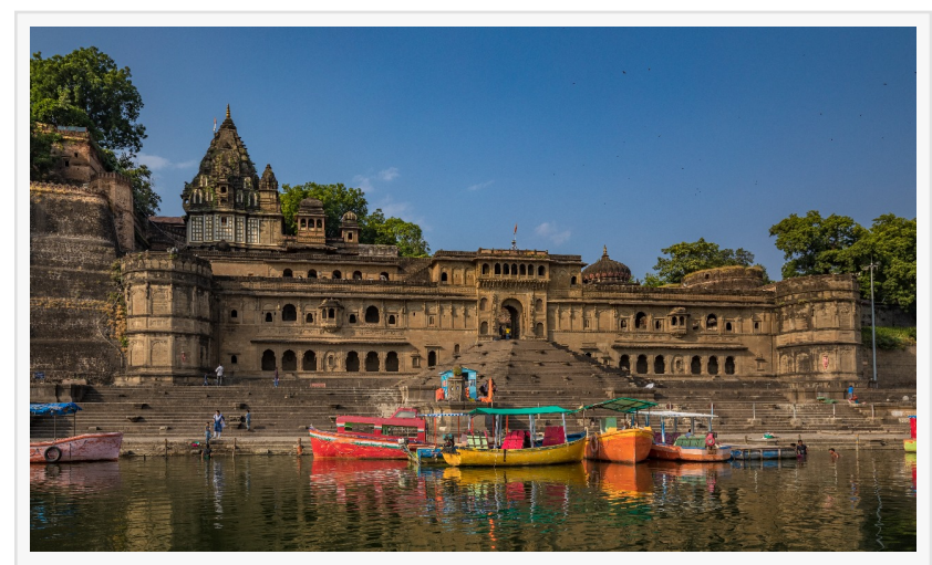
Ahilya Fort - Maheshwar: A Majestic Blend of History and Serenity