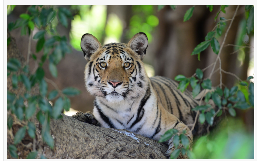
Panna Tiger Reserve in Madhya Pradesh

destination of first choice and recently we are seeing its resurgence as a cultural, religious destination." He added "The record-breaking tourist arrivals are a testament to Madhya Pradesh's immense appeal as a diverse and enriching travel destination. The continuous emphasis on developing infrastructure, promoting religious tourism, and highlighting our