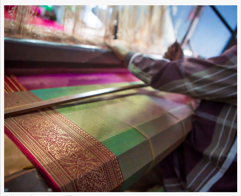
Chanderi Handloom Weaving

it's a forest-rich state that has added to its green cover. Known as the 'The Tiger State of India', Madhya Pradesh is the only State where cheetahs were released in the Kuno National Park, where they have settled and procreated. From deer to wild boar to tigers, Madhya Pradesh is a world of wild animals. For avid nature lovers, there are 11 National Parks, 6 Tiger Reserves and 18 Wildlife Sanctuaries to quench their adventure thirst. The heart of India, Madhya Pradesh is a kaleidoscope of nature.