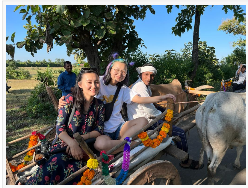
Rural Tourism in Madhya Pradesh: where traditional culture, vibrant festivals, and breathtaking landscapes create unforgettable memories

Madhya Pradesh is also referred to as 'The green heart of Incredible India' as