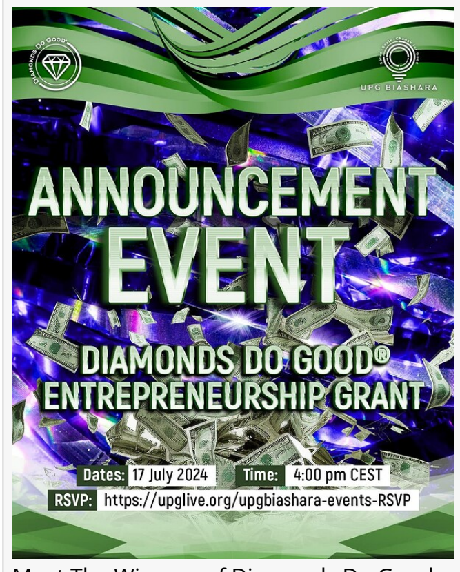
Meet The Winners of Diamonds Do Good Grant®

The Diamonds Do Good® Entrepreneurship Grant is known for supporting outstanding entrepreneurs. The grant provides financial support ranging from $5,000 up to $20,000, enabling the winners to scale their businesses and amplify their positive impact on society. As part of the design and the impact of the Grant, the Finalists go through a development process that includes completing the UPG Biashara