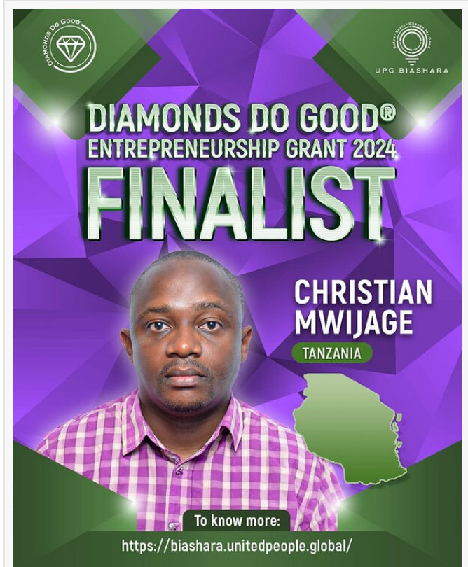
Finalist Diamonds Do Good® Entrepreneurship Grant

In 2024 each of the 24 Finalists have demonstrated remarkable resilience and determination to reach the final stage of the Diamonds Do Good® Entrepreneurship Grant. Their businesses represent diverse industries