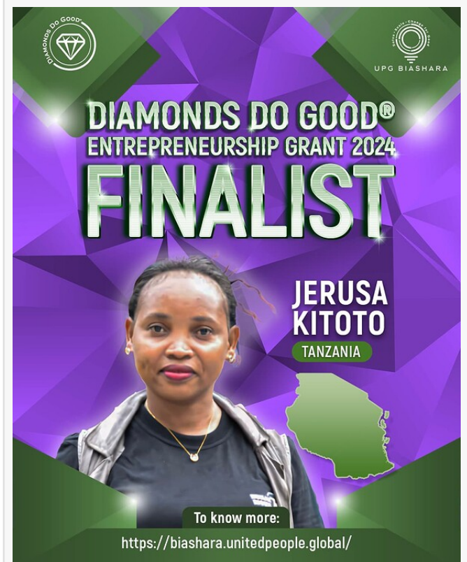
Finalist Diamonds Do Good® Entrepreneurship Grant