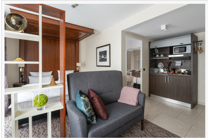
KING's Advastay Apartment

KING's Hotels Munich holds the gold certificate for the Bavarian Environment and Climate Pact, a testament to their dedication to sustainability. This pact, established in 1995, encourages companies to exceed legal environmental requirements and develop innovative solutions to environmental challenges.