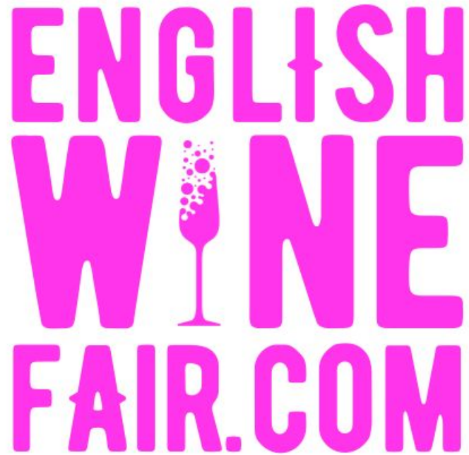
English Summer Wine Fair Logo

Food market vendors include Bray Cured charcuterie, Ostra Regal Oysters, scones and cakes