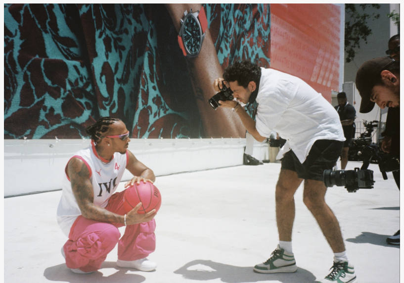
Lewis Hamilton.