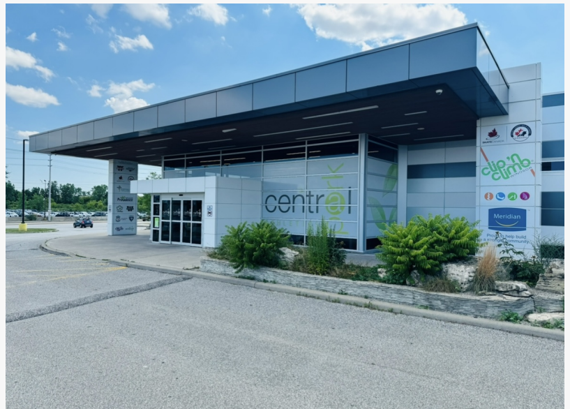
BioSteel Sports Academy at Central Park Athletics