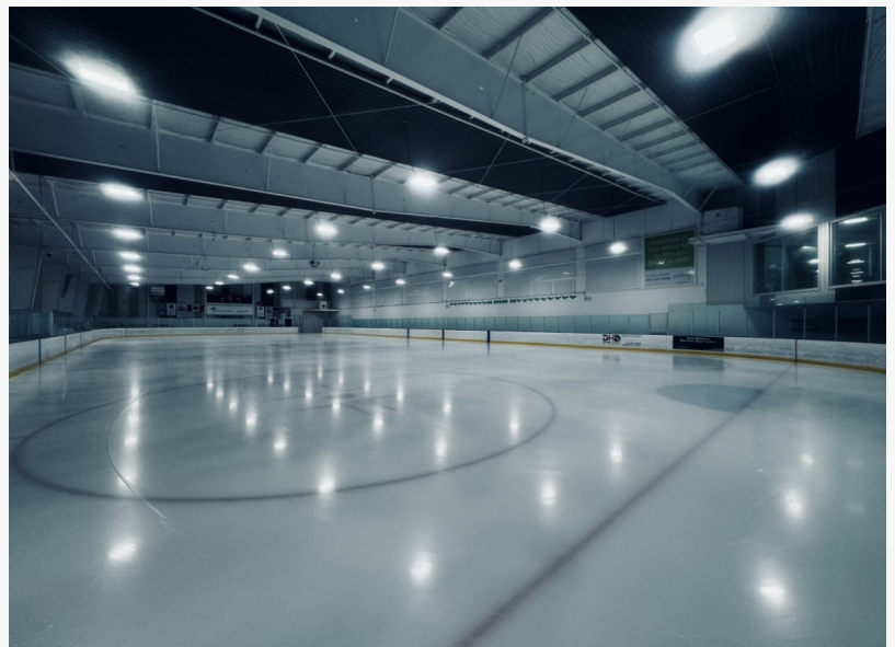
BioSteel Sports Academy Hockey Rink #2 at Central Park Athletics

This is great news as BioSteel Sports Academy is now located in a facility that aligns with its vision of excellence, both in hockey and academics. Local aspiring hockey players as well as those from across Ontario, Canada and internationally will be excited and proud to be part of BioSteel Sports Academy and to call Central Park Athletics their home.