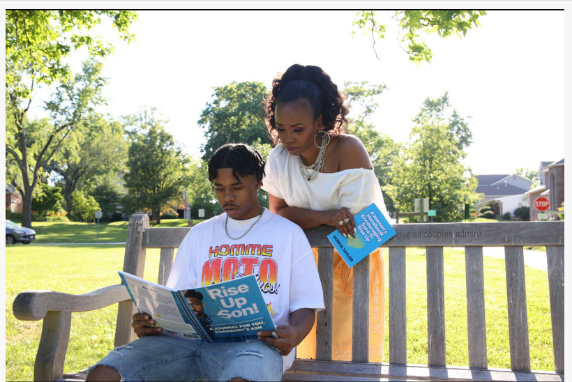
Rise Up Son and A Women's Handbook Encouraging Sons to Rise Up

1 Timothy 2:1-5 NASB2020: "First of all, then, I urge that requests, prayers, intercession, and thanksgiving be made in behalf of all people, for kings and all who are in authority, so that we may lead a tranquil and quiet life in all godliness and dignity. This is good and acceptable in the