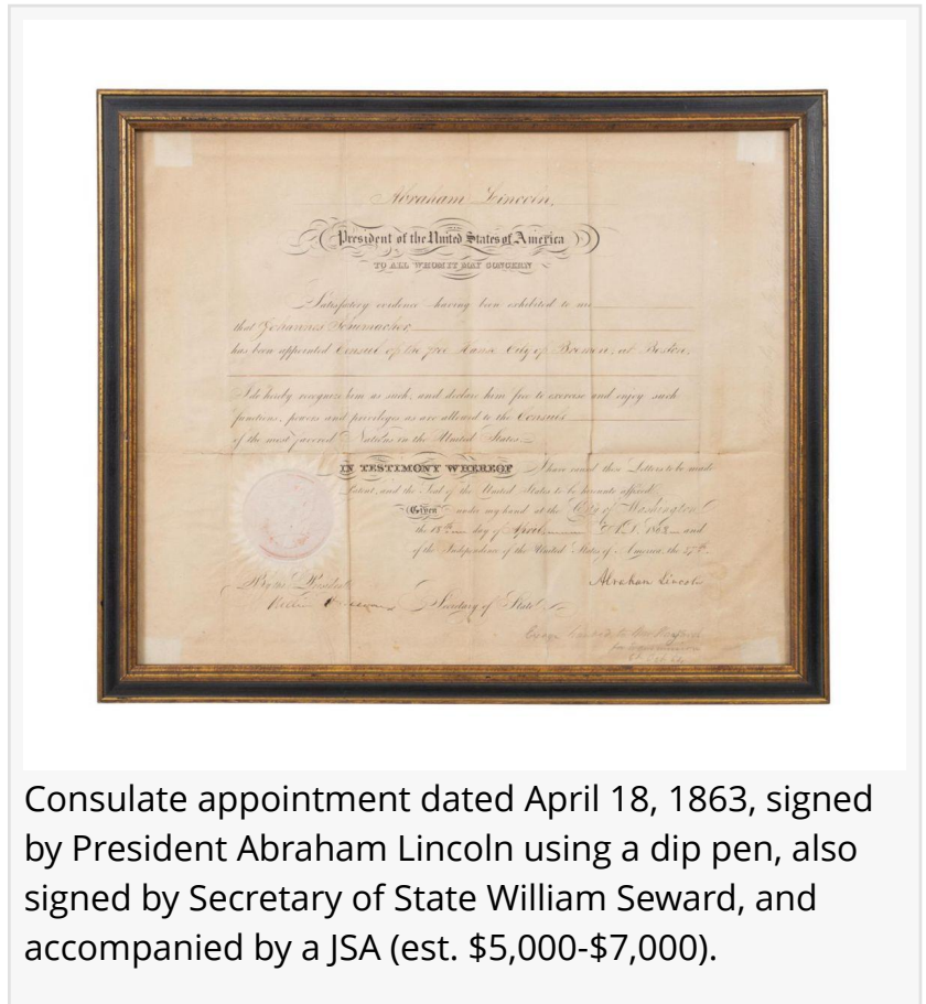
Consulate appointment dated April 18, 1863, signed by President Abraham Lincoln using a dip pen, also signed by Secretary of State William Seward, and accompanied by a JSA (est. $5,000-$7,000).

ATLANTA, GA, UNITED STATES, July 10, 2024 /EINPresswire.com/ -- Ahlers & Ogletree has back-to-back online auctions planned for Wednesday, July 17th ( Historical Documents, Books & Americana , 352 lots) and Thursday, July 18th ( Asian Works of Art , 189 lots), beginning promptly at 10 am Eastern time on Wednesday and 9 am on Thursday. Online bidding will be facilitated by LiveAuctioneers.com, Invaluable.com, and A&O's own bidding platform (bid.AandOAuctions.com).