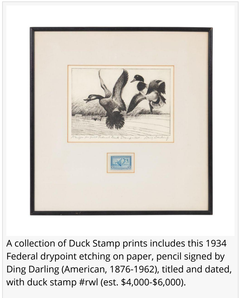
A collection of Duck Stamp prints includes this 1934 Federal drypoint etching on paper, pencil signed by Ding Darling (American, 1876-1962), titled and dated, with duck stamp #rwl (est. $4,000-$6,000).

Ahlers & Ogletree is a multi-faceted, family-owned business that spans the antiques, estate sale, wholesale, liquidation, auction and related industries. Ahlers & Ogletree is always seeking quality consignments for future auctions. To consign a single item, an estate or a collection, you may call them directly at 404-869-2478; or, you can send them an e-mail, at