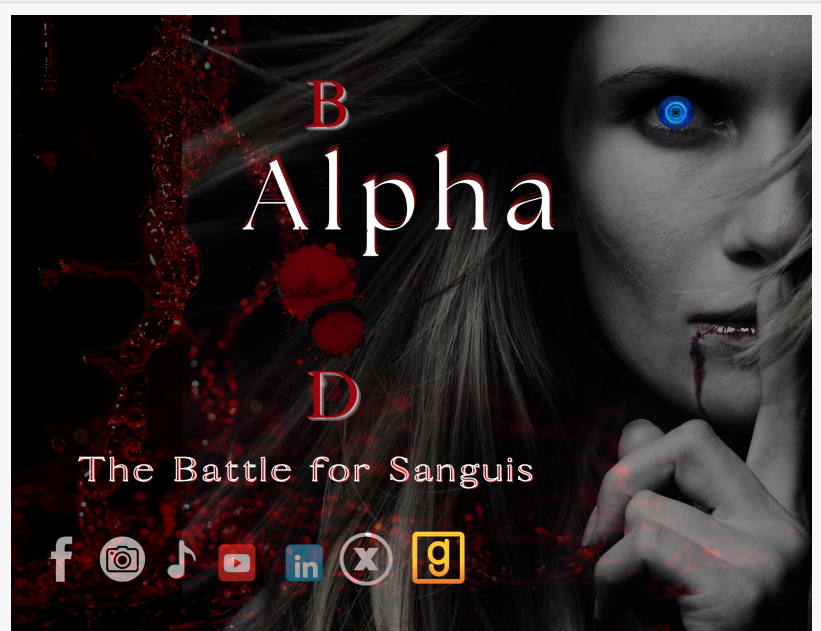
Alpha Blood - The Battle For Sanguis