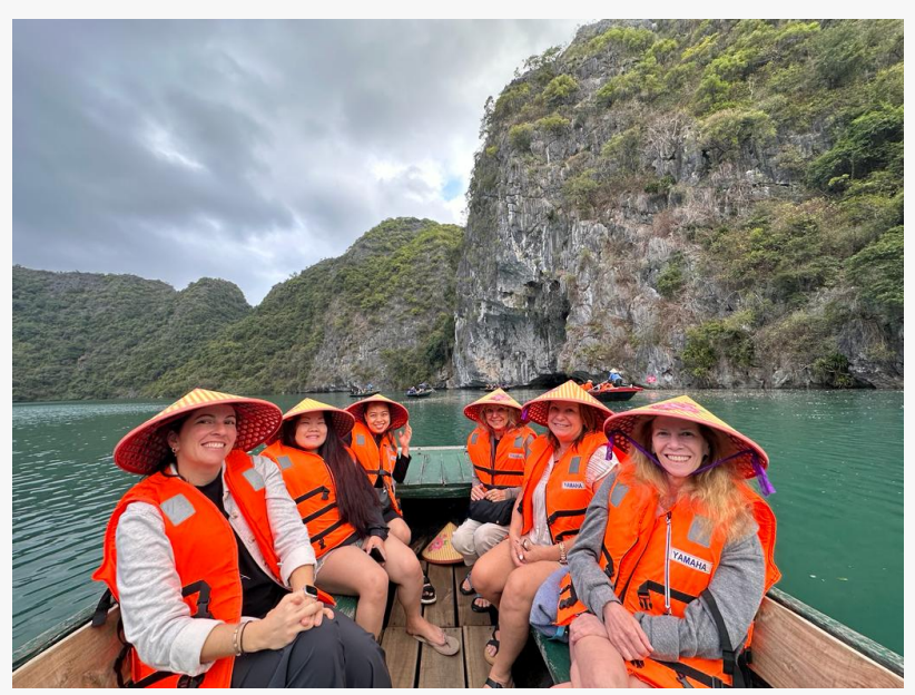
Bonding in Vietnam

globe. We hope this recognition continues to drive business to you in 2024 and beyond."