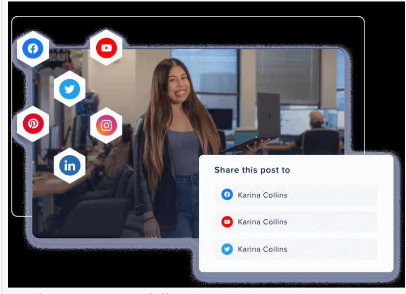
marketing agency dallas