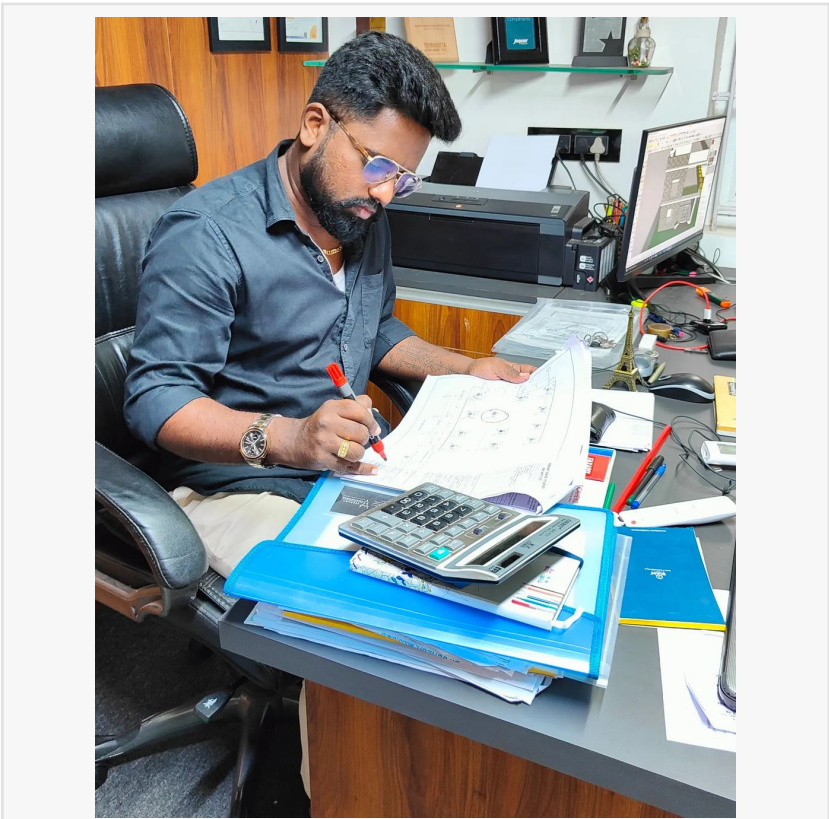
Verdant Space Studio