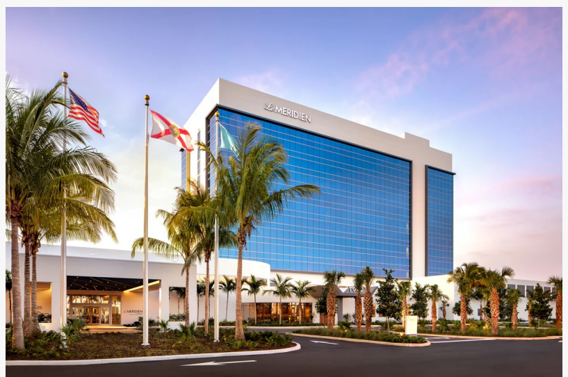
Le Méridien, Dania Beach | Fin+AI 2024 Conference Venue & Host Hotel

"The positive response to this fresh approach in the financial industry conference space is energizing. Attendees are seeking new insights, and will be inspired by the innovation happening at the intersection of Artificial Intelligence and Fintech. "