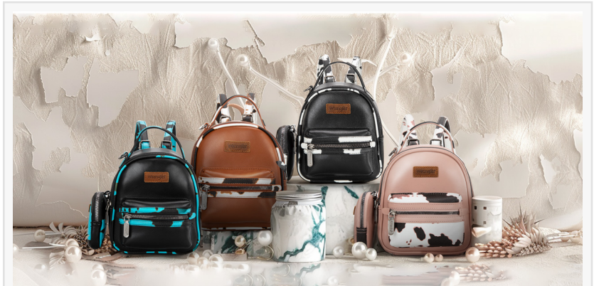
Wrangler Cow Print Mini Backpack

The debut cow print backpacks follow the success of the cow print crossbody, duffel, and camera bags, continuing the stylish and high-quality tradition of the series. The new backpack lineup features four silhouettes: the 'Mini Moo' in both all-over and understated cow prints, and the regular-sized 'Moo Traveler' with corresponding designs.