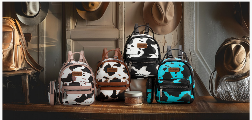
Wrangler Cow Print All-over Mini Backpack