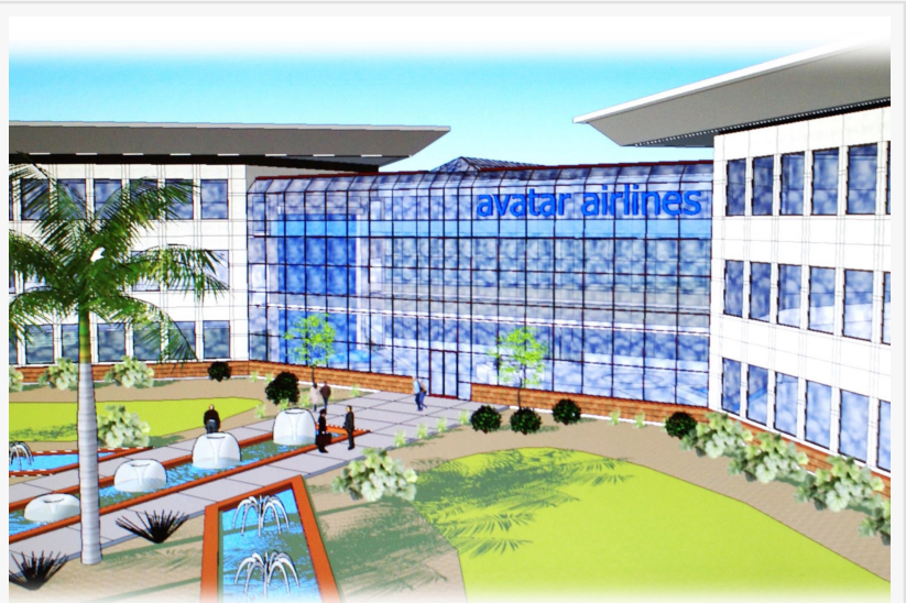
Avatar's Future Headquarters/Training Center

Joining Avatar Airlines means becoming part of a revolutionary movement that will change the way the world flies. You will have the unique opportunity to lead a major airline from the ground up.