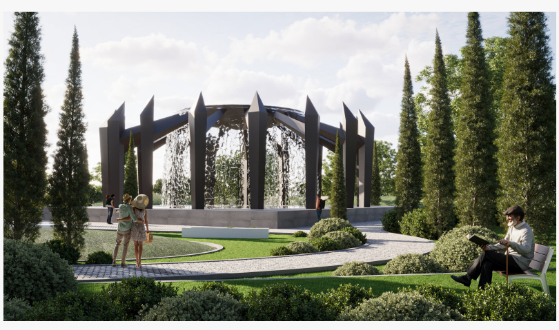
VLC One, Inc., Hollywood, Florida

placard is provided at the memorial entrance.