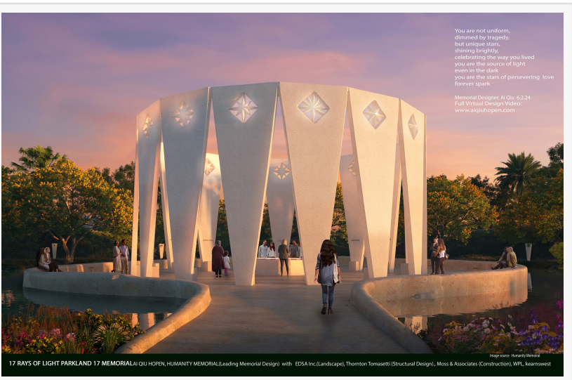
Humanity Memorial Inc., Sutton, West Virginia, with EDSA, Inc., Fort Lauderdale, Florida and Dills Architects, Virginia Beach, Virginia

VLC One, Inc., Hollywood, Florida: There will be 17 angular sculptures rising 30 feet, each extending outward to a sheer curtain of water flowing continuously into a reflection reservoir. Each sculpture represents an individual precious life lost. The eternal cascading flow evokes ideas of profound depth, changing feelings, love and sadness, but also rejuvenation, and transformation. A 16-inch (minimum) cast bronze plaque is permanently embedded into each pillar as a tribute to each victim with an optional "bas relief" portrait as well as a QR code for more information. Permanent tasteful seating will be included surrounding the memorial. A separate historical