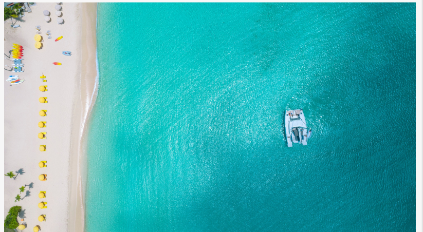
Anguilla is known for her spectacular beaches